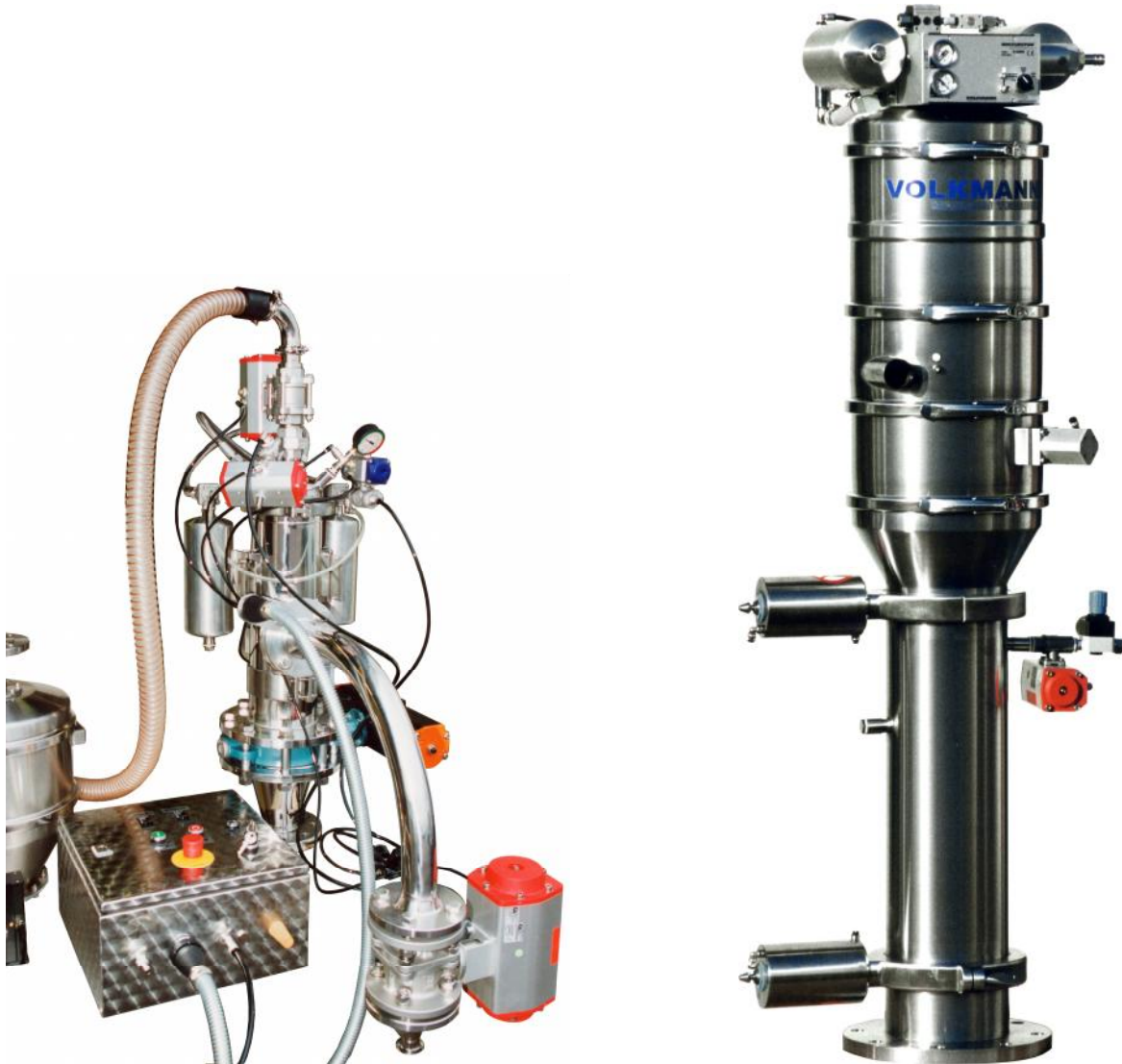
Fig 3 – Examples of an Inert Gas Based Conveyor (Left) and a Powder Lock System (Right)

This principle is expandable, so the Vacuum Conveyor can be designed to provide a positive pressure powder-lock if required. In this case, special pressure-resistant receiver vessels and valves are used to build the Vacuum Conveyor (fig. 3).